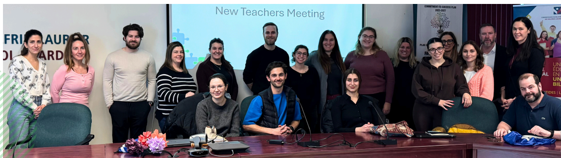
LTU meet with New Teachers in February to inform them of their rights

The form to request a partial or full-time leave of absence without salary for next year is available on the SWL Portal . Teachers currently benefitting from a LOA will receive a letter from HR asking if they are requesting another leave of absence or returning full-time to work for the 2025-2026 school year. The deadline to submit a request is March 31st. For more information on the nature, duration, terms and conditions of leaves of absence without salary as well as inherent rights and obligations excluding leaves provided for under Union prerogatives, parental rights and leaves for public office, you can consult your local collective agreement under clause 5-15.00.