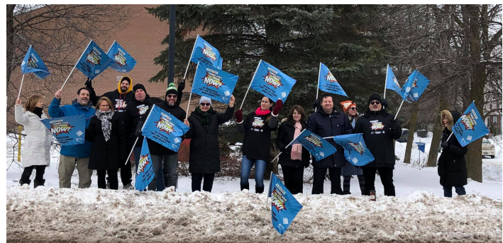
LTU, Rosemere (Pre-COVID)

QPAT Website: Mobilization & Negotiations