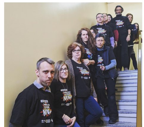
CDC Vimont Adult Education