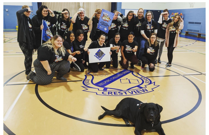
Crestview ES, Laval