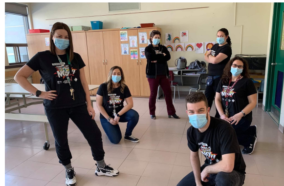
Pinewood ES, Mascouche