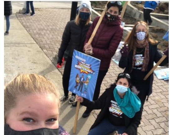
Ste.Adèle ES, Ste. Adèle

"A strike action may come sooner than later and we will inform you as soon as the opportune time arises."